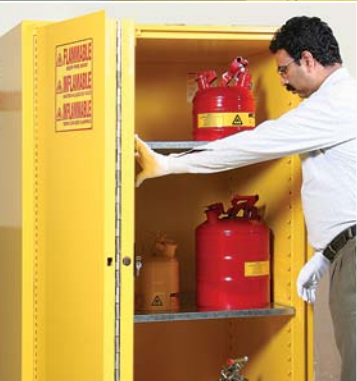
Bi-Fold Self-Closing Doors