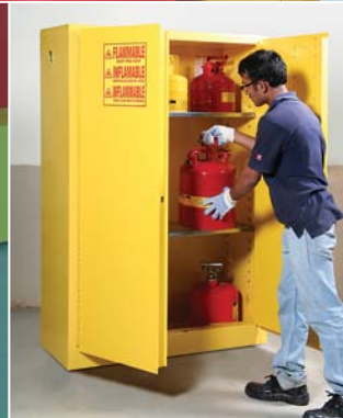
Each door latches open with a fusible link