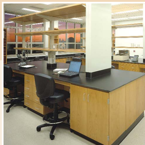
Emory University — Whitehead Building LEED Silver Certified