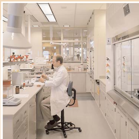
Pharmacia — Building Q LEED Gold Certified