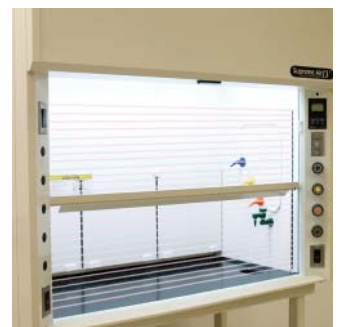
Infrared "Light Curtain"