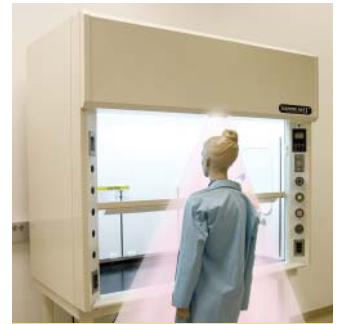
Overhead Infrared Sensor

With the Automatic Sash Operator, Kewaunee now offers increased laboratory and fume hood safety and maximizes energy and operating cost savings on the industry leading Supreme Air LV fume hood.